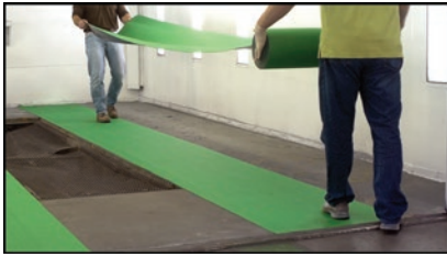
Fast installation in less than 30 minutes

anchored by New Pig Grippy® Technology New Pig