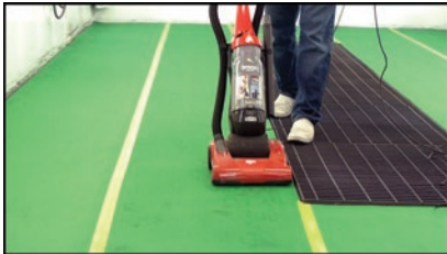
Vacuum daily 1 to remove contaminants