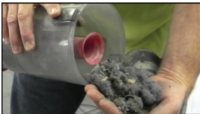
Typical amount of dirt removed daily